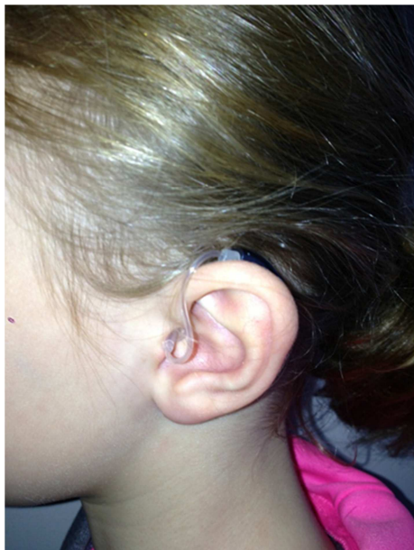
Picture 1 The youngest child, age six, wearing a size 0 SlimTube and small open dome. She did not experience any problems with insertion loss, discomfort or retention.

All children in this study, including the youngest first grader, could be fitted with a SlimTube and a standard dome (Picture 1). This included a total of 7 subjects between 6 and 8 years of age. At the time of the initial fitting, 12 out of 15 children chose to continue to use the SlimTube and open dome over the custom earmolds that were used for their previous FM systems. The remaining 3 children wished to go back to the custom earmold solution that had previously used. The SlimTube was replaced with a pediatric earhook and the dome was replaced with an earmold and standard tubing. 12 children (86%) chose to wear the Roger Focus over their previous FM unit. The remaining 3 children had no preference between Roger Focus and their previous FM unit. The primary reported reasons for preferring the Roger Focus system were wearing comfort, access to volume control, sound quality and retention.